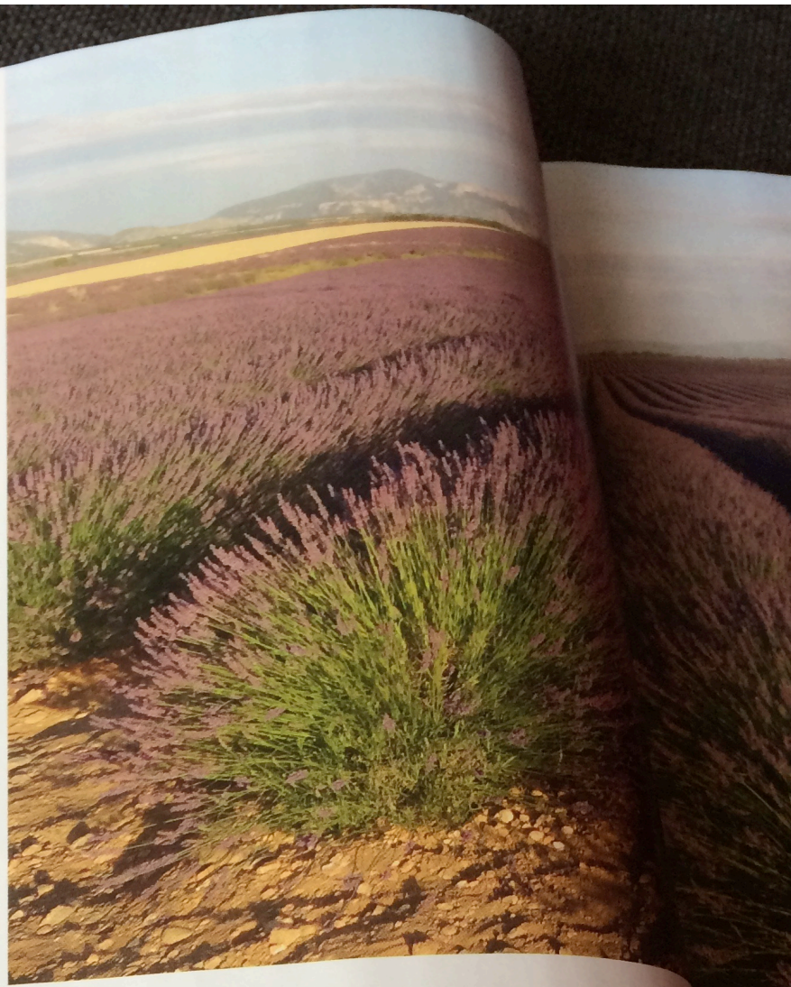
Clockwise from top left: You can learn French on a speedboat; fields of lavender in June; Brigitte helps to make learning fun; visit the famous Calanques, by land or sea; Brigitte's villa has a swimming pool, ideal for verb revision

oenological vocabulary in the mornings, and then we can organise guided visits to vineyards and winemakers in the afternoons."